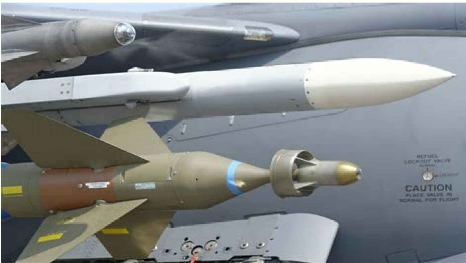
Traditional weapons of india. Why india buy weapons from other countries. Does india have space weapons. Weapons originated in india. Indigenously developed guided weapon system of india. Which of these is indigenously developed guided weapon system of india.